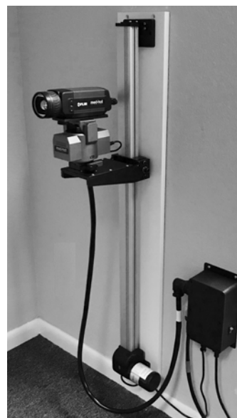
In-office Wall Mount