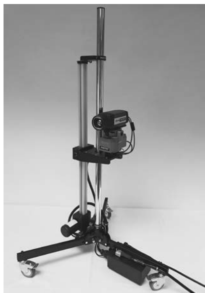
Portable Mobile Stand